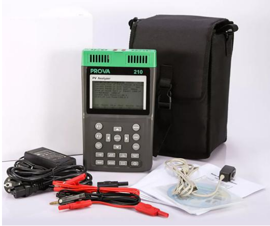
Figure 2. Prova 210A Solar Module Analyzer .

The present work was done during July 2024 to April 2025. The experimental work was obtained under the outdoor exposure in Baghdad-Al-Jaderia. The readings were taken in a selected days, where the atmospheric conditions of clear sky. To study the effect of temperature variations on solar performance, solar irradiance must be kept constant and vice versa. Therefore, to have the temperature range and for more accuracy, the measurements was done for tested module with three solar radiations levels; 500, 750, and 1000 W/m 2