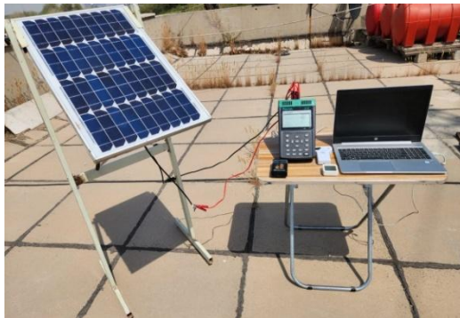
Figure 3. Setup of the experiment

The solar module is cleaned before the tests. The solar module is fixed to the south direction with tilted angle 33° then recording the temperature of the back side of the module (using thermocouple) and start the IV scanning process which is done by the Solar Module Analyzer then save the data in the computer (see Figure 3).