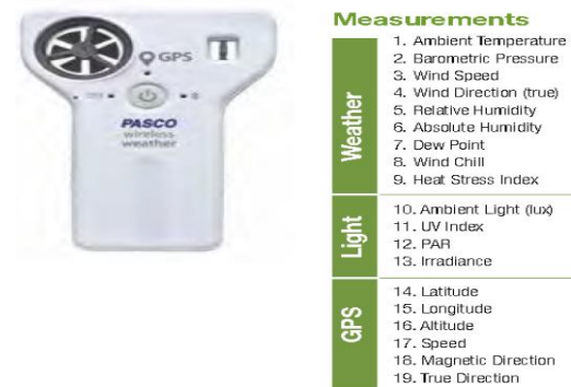
Figure 1. Wireless Weather Sensor with 19 measurements.

Solar module analyzer PROVA 210A is used to test the characteristics solar panel electric parameters ( V_{oc} , I_{sc} , V_m , I_m and P_m ). PROVA 210A generates the I-V curve by variable internal resistive load in ohm ( \Omega ) (0 to \infty ) with time (10sec) therefore for each value of load there is a value for voltage and current from (0, I_{sc} ) to ( V_{oc} , 0). The device has an option to setup the values of both solar radiation and the area of the solar module (Figure 2).